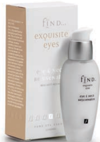
Eye & Neck Rejuvenator